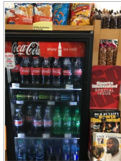
Sugary drinks at a Berkeley store checkout